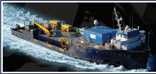
DSV Premier Explorer

Originally founded in Plaquemines Parish, La., in 1997, Premier Industries has compiled one of the most talented groups of construction professionals in the industry. Their focus on quality, safety and productivity has been key to their success.