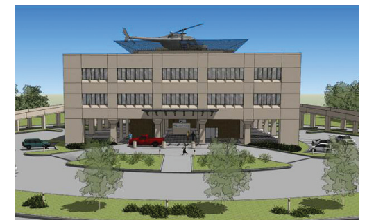
Artist rendering of Plaquemines Medical Center

On March 20, the Department of the Interior's Bureau of Ocean Energy Management (BOEM) held Gulf of Mexico Lease Sale 227, receiving high bids totaling $1.2 billion. Some 52 offshore energy companies submitted 407 bids on 320 tracts. The recent sale reflects a continued interest in oil exploration in the Gulf of Mexico.